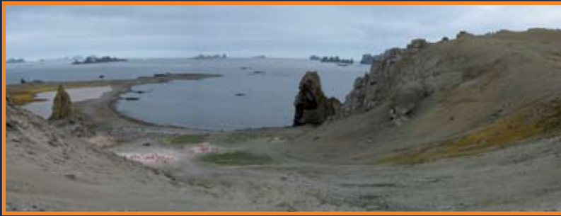
Barrientos Island western landing area

Stay clear of cliffs and vertical walls and stacks as these are prone to rock falls and slides.