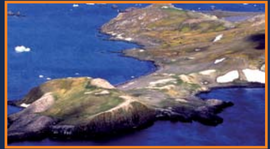
Barrientos Island eastern landing area