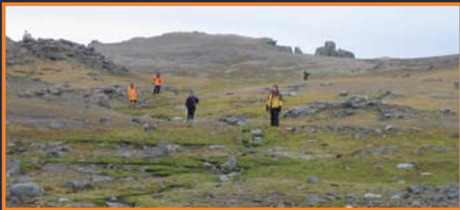
Only walk through Closed Area B if you can clearly recognise the route